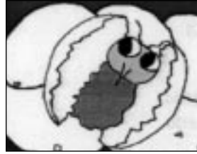
Through the Magnifying Glass , Melissa Bouwman